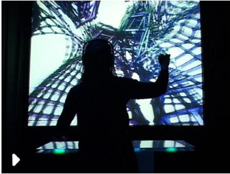
Vain in transit: digital creature, 2005. efs technology multiuser installaton. V2_ Institute for the unstable media, Rotterdam.

ent of the space. This conception is in Descartes' duality mind/body and gets operative character in the representation of reality.